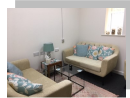
Acorn counselling room